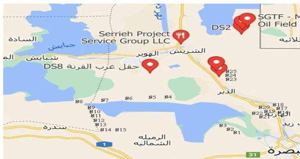
Fig.1. According to station number (S) numbering, dots represented the locations of sample collecting sites north of the Basra Governorate.